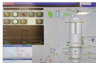
Parameter monitoring screen

Nicomix and Nicobed use PLC-PC control systems with user-friendly, CFR 21 Part 11 compliant software. Each operation is managed to guarantee the operator maximum safety. It also has a washing program in WIP with several completely automated stages to speed up operations and limit operator intervention.