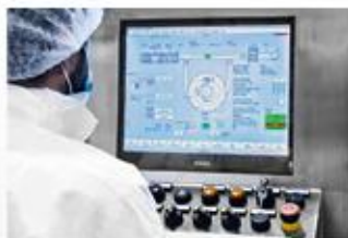
Parameter monitoring system

From the monitors, provided with several password levels and connected to alarm systems, all parameters can be controlled during the different processing stages: inlet air, pan rpm, coating suspension capacity, moisture, process pressures and temperatures.