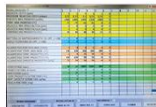
PLC-PC control system

Detailed control of each aspect during the creation, preparation and production stages enables us to obtain high quality finished products, with the characteristics required by the customer. Thanks to a PLC-PC control system integrated in the coating systems and developed with a user-friendly software compliant with CFR 21 Part 11, Euronovis can memorise up to 100 recipes that guarantee process replicability.